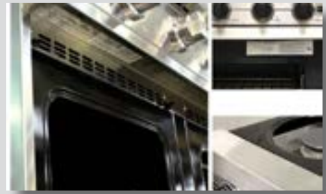
The model and serial numbers can be found on a label in one of three locations.

Description: This recall involves Viking Range freestanding gas ranges sold in stainless steel, black, white and 21 different colors and finishes. The ranges were sold in various surface configurations: All burners or burners with griddle and/or grill. The ranges are about 36 inches tall to the top of the side trim, 30, 36, 48 or 60 inches wide and 24.5 inches deep to the end of the side panel. The model and serial numbers can be found on a label in one of three locations: On the bottom of the control panel above the door, on the front of the oven cavity below the control panel, or on the inside of the left side panel; which can be seen by removing the left front grate and burner bowl. Consumers should only search for the model and serial number when the range is not hot. Model and serial numbers beginning with the following are included in this recall: