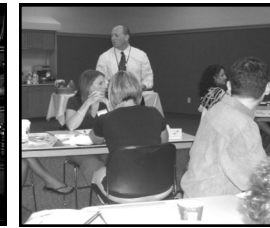
Professional Development Unit