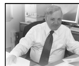
Office of Personnel Relations