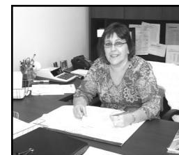
Central Business Office