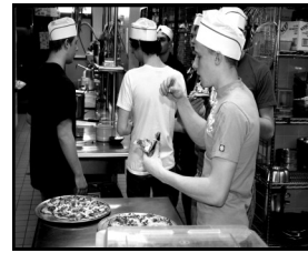
Career & Technical Education