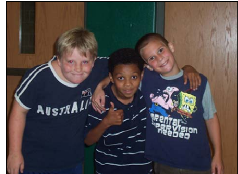
Good friends and good times at summer school!