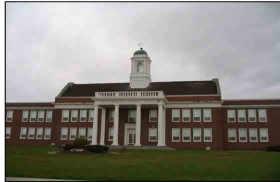
Cato-Meridian Middle School