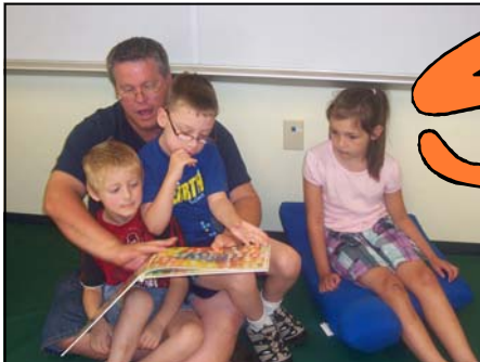
Students enjoy listening to a story.