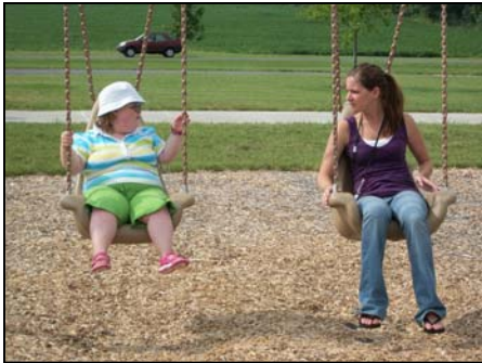
Having some 'girl time' on the swings!

Cayuga Onondaga BOCES hosted another fantastic summer school session for students with disabilities from July 6 th to August 13 th 2010. In addition to their traditional school work, students engaged in a variety of weekly community trips which included swimming at Casey Park pool. Students also enjoyed playing on the playground, participating in games set up in the gym, cooking snacks and meals and taking trips to local stores. These activities provided students with a fun and meaningful way to practice and generalize their social and daily living skills. We hope to have another great summer school experience in 2011!