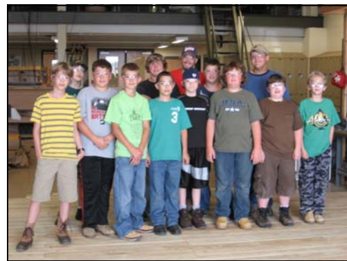
Building Concepts Career Connections Students

Next summer, as many families think about camping or vacationing, consider researching the yurt. We know many of our summer camp students will enjoy seeing one.