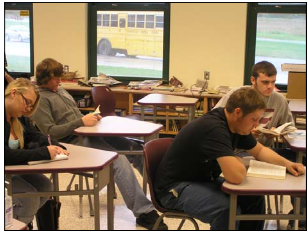
Youth GED students working on their individual assignments.

Both the youth and adult GED programs are test-when-ready and the classes are centered on the student.